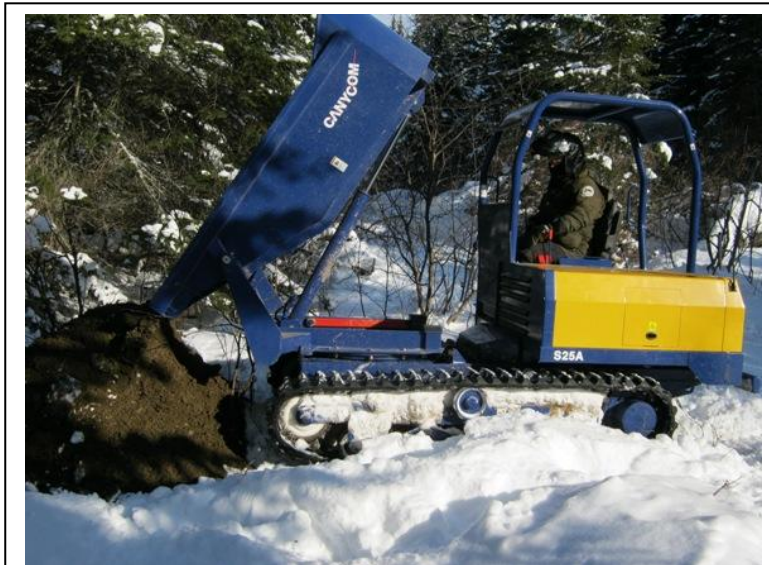
Allagash Ranger delivering gravel to the southern end of the Tramway Carry, winter 2010.

During the winter of 2010-2011 the Allagash Rangers have been moving loads of gravel across Chamberlain Lake to use for our Tramway Carry Project. The gravel has begun its journey at the Upper Crow's Nest campsite and in all the Rangers have done 48 seven mile long round trips to the southern end of the Tramway Carry.