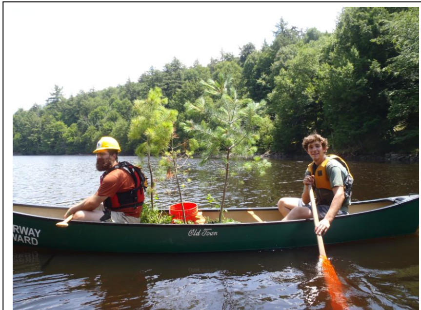
Transporting saplings at a 2010 Franklin Falls, NY WWT. We will be planting saplings as well as utilizing other site rehabilitation techniques to bring a disturbed area back to a more natural state.