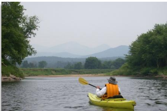
Watch a video of NFCT's Kate Williams paddling on the CT River! Credit: NH Fish and Game

From there, make your way to the beautiful waterfall, park and trails of Beaver Brook Falls, 2.5 miles north of Colebrook on Route 145. Less than 5 miles further north on 145 is the Poore Family Homestead , a remarkable historic site depicting rural farm life before electricity. The homestead was featured in the March, 2013 Yankee Magazine . Continue north to Pittsburg (6.5 miles) and take in the grandeur of the Connecticut Lakes, a Mecca for anglers looking for landlocked salmon, and rainbow, brook and lake trout.