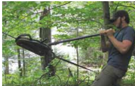
Zip-lining 500 lb. rocks; Permanent Rapids, NY.