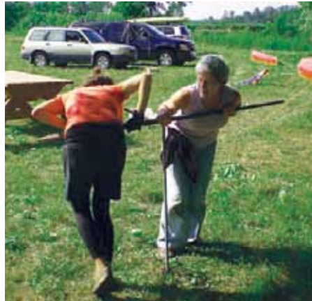
Driving a picnic table anchor; Maidstone, VT.

► Attean Pond: The NFCT intern crew and WWT volunteers worked with the Maine Forest Service to install 15 sections of bog bridging on the Moose River Loop Trail and rehabilitate two campsites at Sally Beach.