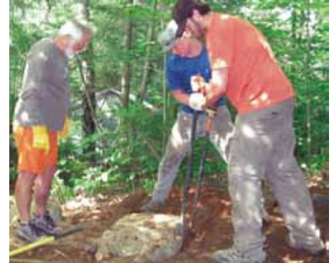
Crow bars in action; Permanent Rapids Carry, NY.

In New York, life jackets are now mandatory when on board vessels less than 21 feet in length, November 1 – May 1. This applies to many a canoe and kayak! NFCT strongly recommends wearing a life jacket no matter what time of year you paddle.