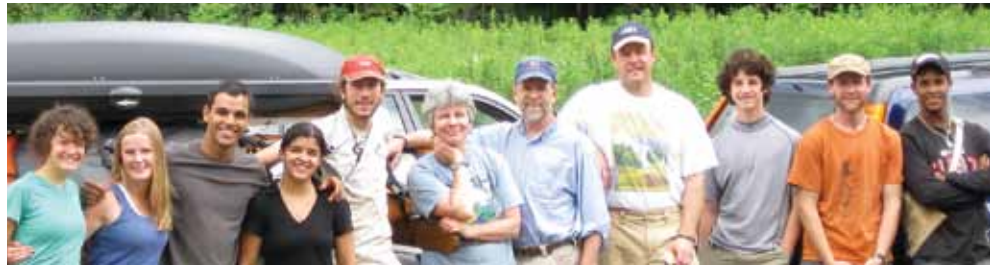
Waterway Work Trip volunteers and stewardship interns at Highgate Falls, VT