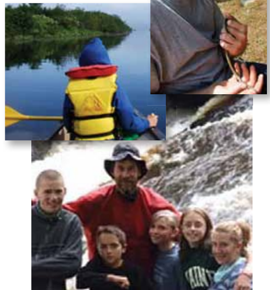
Young “explorers” got in touch with the woods and waterways in their own backyards this summer.

organization secured funding and hired an intern to assist with trip leading; Adventure Bound provided high quality guiding; and our school and community based partners recruited participants; and the kids—the kids!—provided energy, enthusiasm, and hope...the best ingredients of all. Additional thanks to the Natural Resource Education Center (NREC) who provided the initial inspiration and partnership that got this program off the ground in 2008.