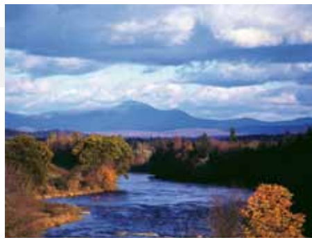
Vermont's Missisquoi River is included in a couple of itineraries and the "Montgomery Marvels" package.