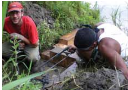
Getting dirty; Highgate Dam Portage, VT.