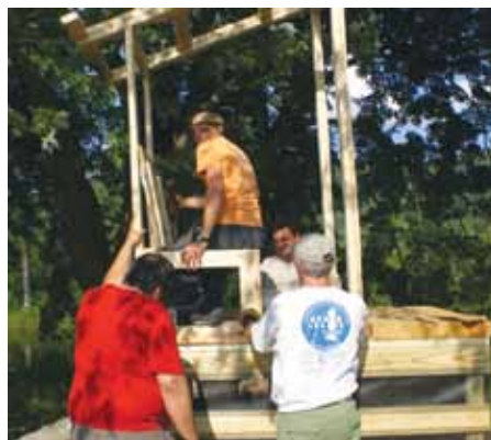
Building an outhouse; Samuel Benton Campsite, VT.