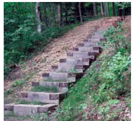
New steps; Highgate Falls, VT.

NFCT Blog! NFCT is actively maintaining a blog – Voices from the Trail. Don't miss our musings, including both on- and off-water experiences that you won't hear about anywhere else! You'll find it on our website, where our Web 2.0 page provides links to our blog, as well as our Twitter and Facebook pages.