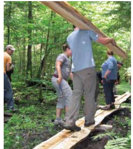
Laying bog bridging; Attean Pond, ME.