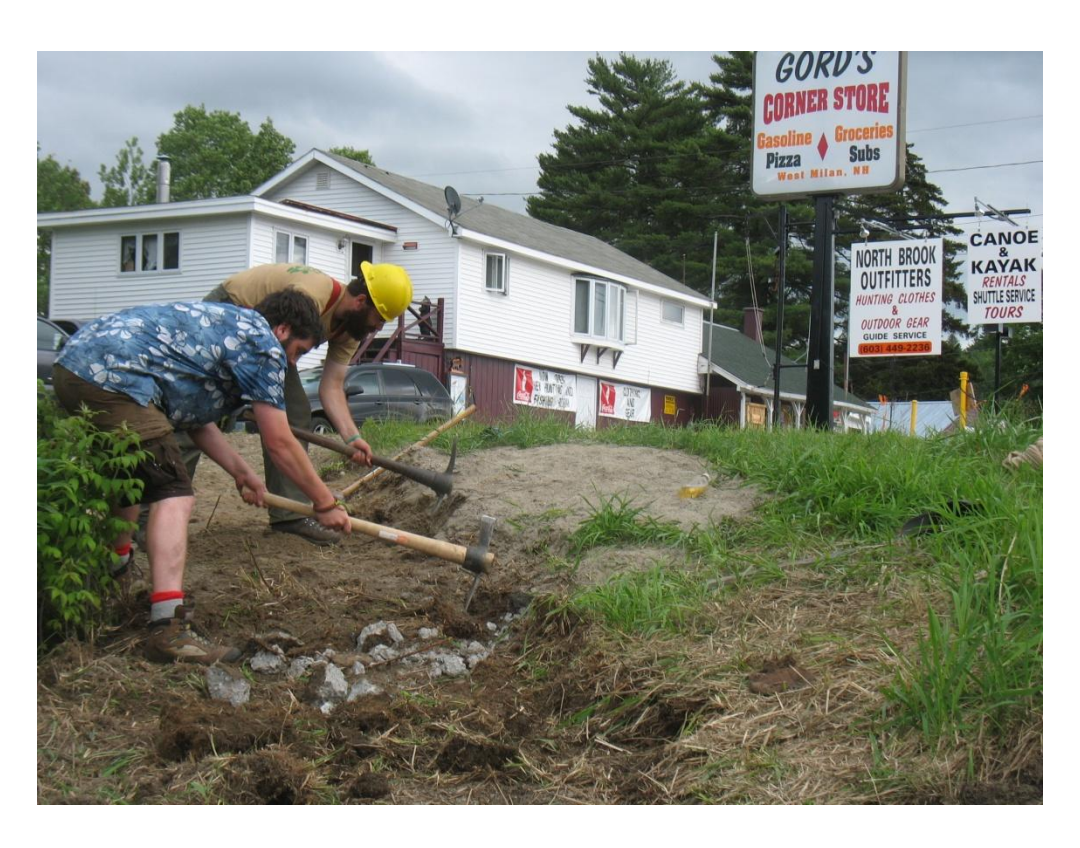
NFCT Stewardship Crew Members working on Gord's Access.