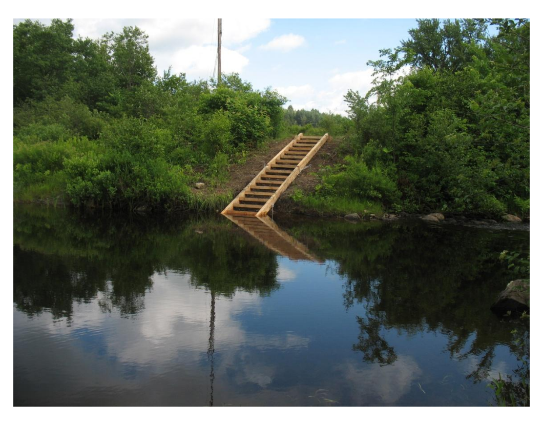
Gord's log ladder access.