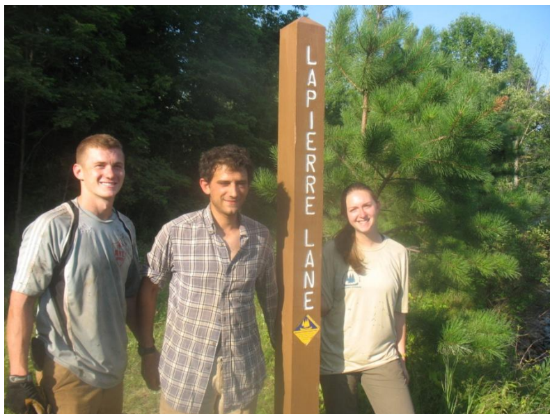
2014 NFCT Stewardship Interns pose near the newly installed marking post at the LaPierre Property in the Town of Plattsburgh.

Site Information: The campsite is marked with a riverside post marked "LaPierre Lane." Upon landing, you will find yourself on a small loop trail that follows the border of the small town parcel. The campsite's tenting area is tucked back in the woods down a small trail corridor near the take-out. The campsite has a level area that can accommodate up to three tents. There is a picnic table and a sign-in box (please sign-in). However, no privy was installed. Please use all Leave No Trace Principals , including burying all human waste in catholes dug 6-8 inches deep and well away from the river.