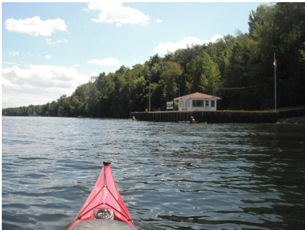
View of the Canadian Customs Station.