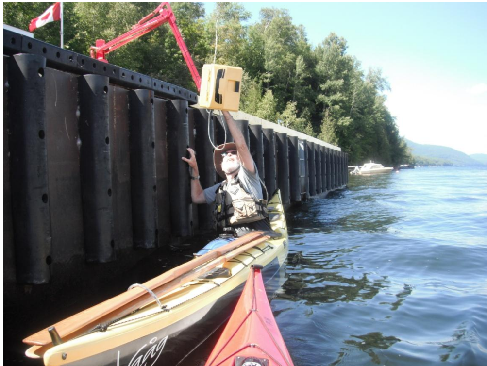
Using the phone to report entry.