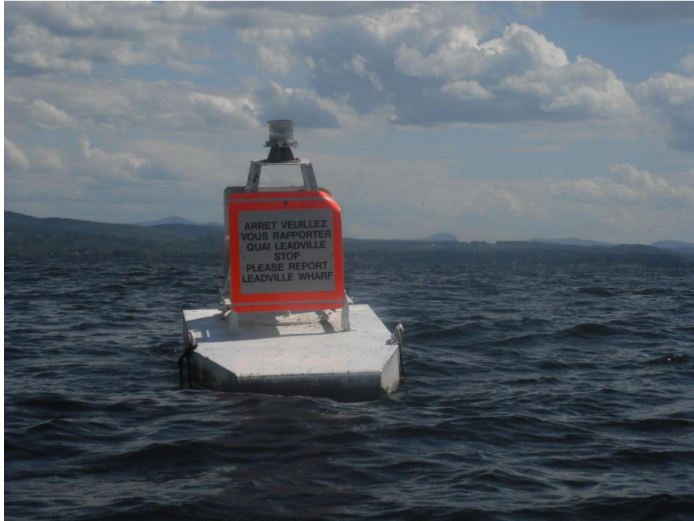
One of the buoys marking the border line.