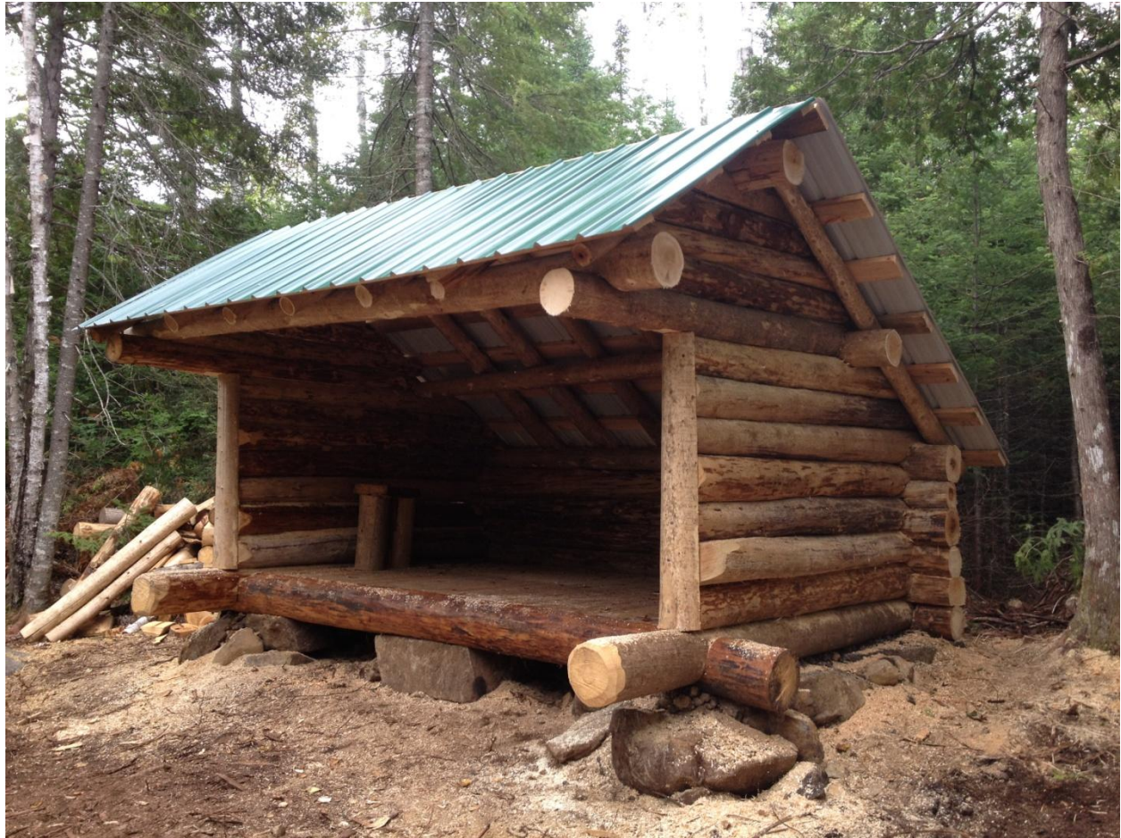
Maine Forestry Museum Lean-to.

Lean-to: The Lean-to can sleep 4-5 comfortably. It is based on the Adirondack designs. The NFCT plans to build a double chamber moldering privy and fire ring in 2015. Until the outhouse is installed please use the Leave No Trace principals and leave the location better than you found it.