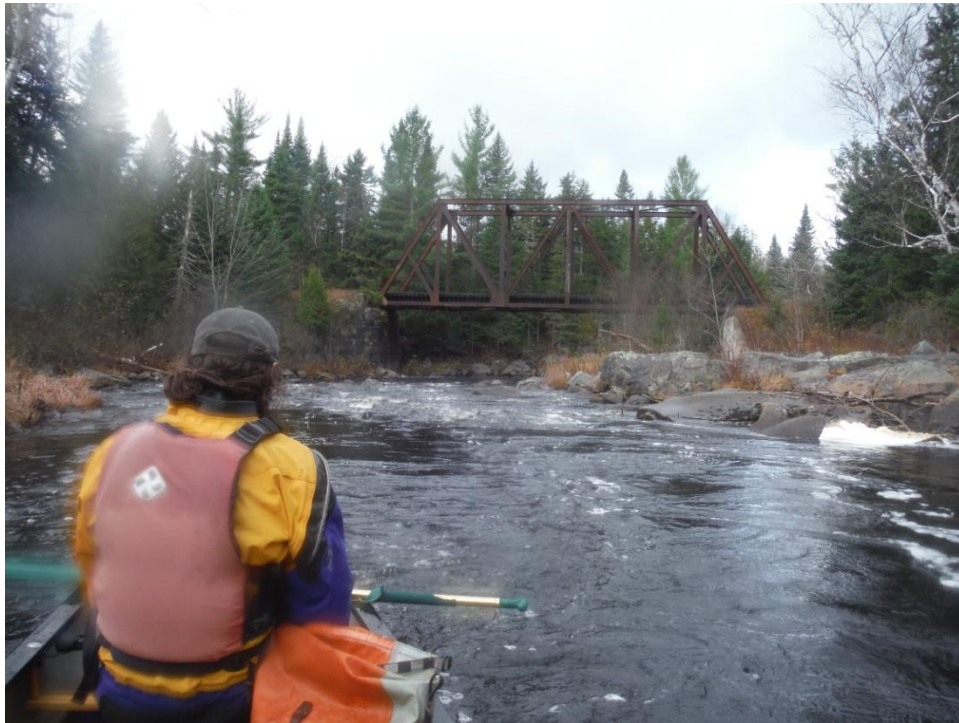
Getting ready to ferry across the Nulhegan River to the Moore Portage around the lower gorge.