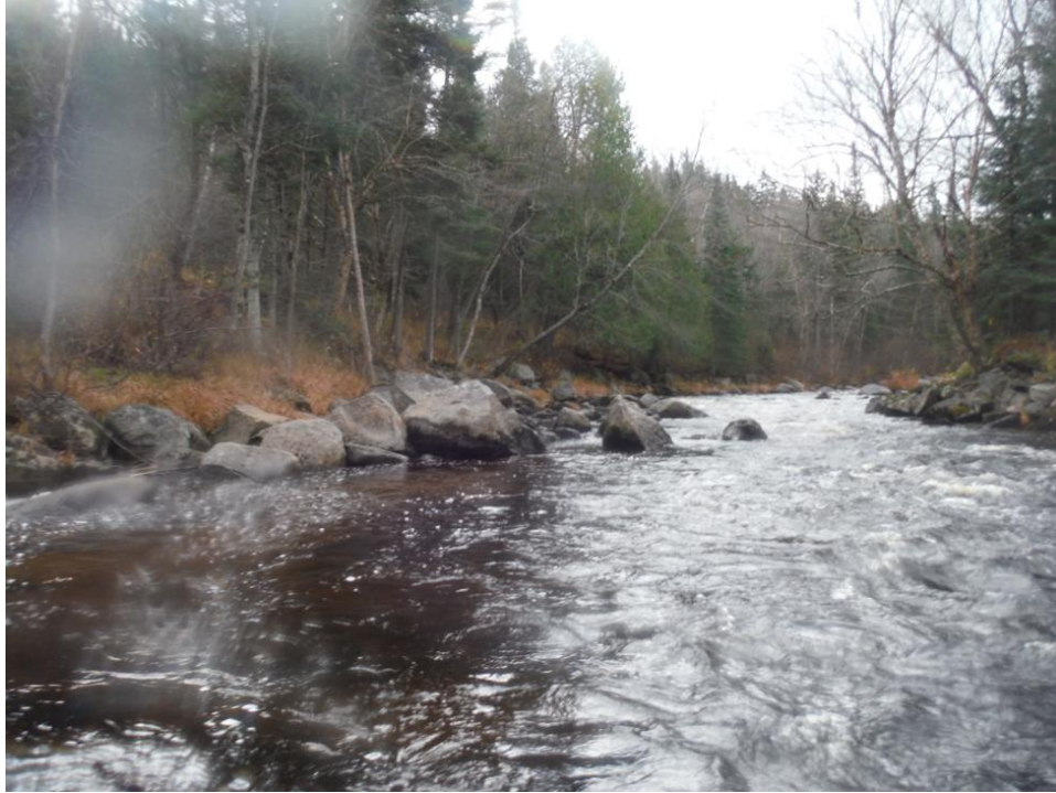
View approaching the rocky section near the Silvio O. Conte National Wildlife Refuge Nature Trail.