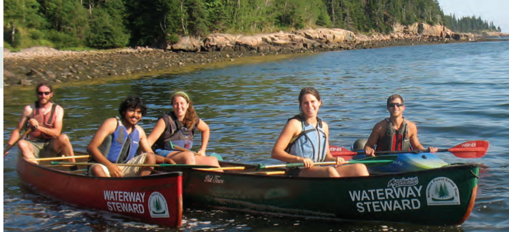
NFCT interns take a break on the Allagash Wilderness Waterway in between leading two work trips on the Indian Stream Carry.