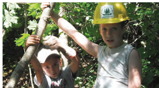
Today's stewards come in all ages! These guys did volunteer work along the Androscoggin River last summer.