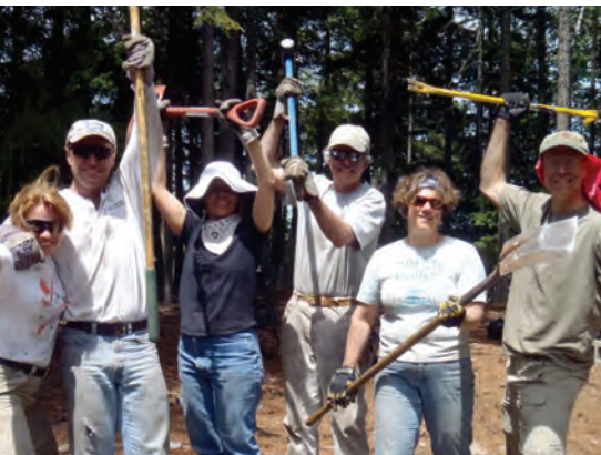
We welcome groups to help with trail projects. It's a great opportunity for team building!