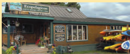
NFCT members get 10% off paddling gear, free coffee, and drinking water fill-up at Ecopelagicon in Rangeley, Maine.