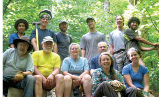
Five NFCT Waterway Work Trips and 150 volunteers provided critical trail work this year.

During our 2012 field season, trail improvements were made in all 13 sections of the NFCT! We were only able to do this thanks to the generous support of our members, trail volunteers, the NFCT Trail Fund, and the supportive businesses and communities along our route. Enormous thanks to the Lake Champlain Basin Program , the Maine Outdoor Heritage Fund , the Northern Border Regional Commission and REI .