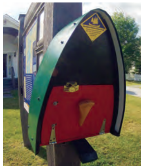
Paddler entries in sign-in boxes like this one on North Hero Island provide valuable usage data as well as tracking paddler information in case of an emergency.