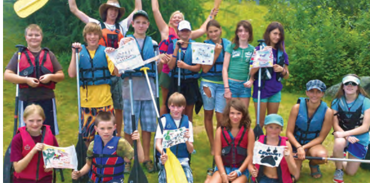
Northern Forest Explorers spend 5 days paddling the Trail learning valuable outdoor and leadership skills.