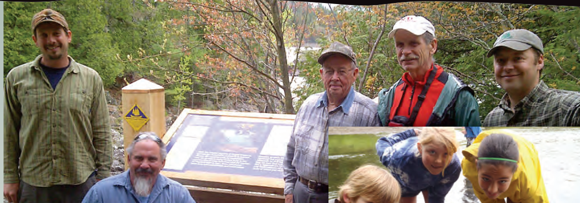
ABOVE: An interpretive display was dedicated last spring on Flagstaff Lake near Stratton, ME. RIGHT: Richford, VT is a key community Northern Forest Explorers paddled through last summer.