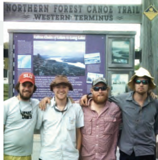
Old Forge, NY is NFCT's eastern terminus and the starting point for Through Paddlers, like the Rough Water Gypsies

We are grateful to the citizen, business and municipal partners who have rolled up their sleeves to help designate these Trail Towns. As well, we look forward to our ongoing work with other trail-wide communities to create great experiences for paddlers on the entire Northern Forest Canoe Trail!