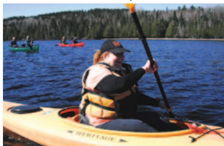
Trail maintainers gather each spring to hone trail building skills and enjoy the destination's scenery.

NFCT Jamborees celebrate and educate our trail volunteers at the start of each paddling season. Each weekend focuses on trail maintenance training, and includes a group paddling trip, recognition ceremony, and eating good food.