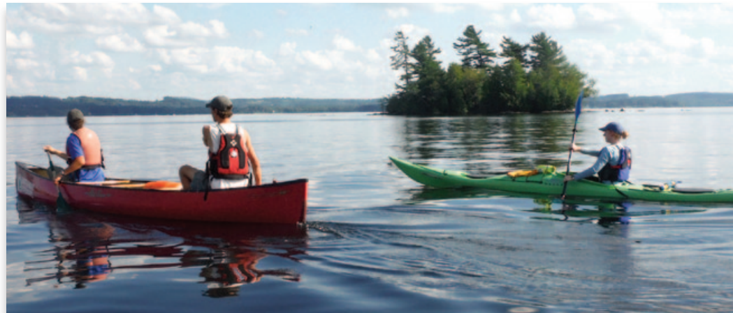
Interns paddling to Eagle Point Campsite on Lake Memphremagog. A beautiful commute in need of an adopter!