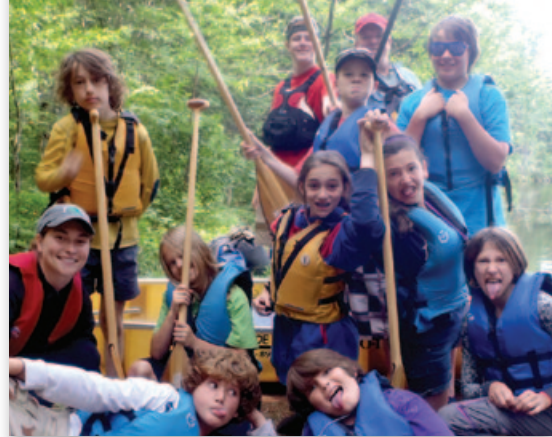
A happy ending after a 5-day trip last summer on New York's Tupper and Saranac lakes.

Free. Bring your own canoe/kayak and paddling gear, or call for local