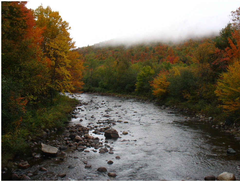
Figure 2. East Branch of the Nulhegan