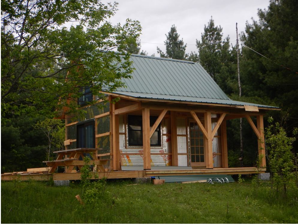
Figure 1. Nulhegan Hut