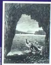
La caverne de l'île Skinner Cette caverne, creusée de main d'homme sur une île du lac Memphrémagog, fut le refuge d'un célèbre contrebandier, Utah Skinner, qui y cachait son butin.