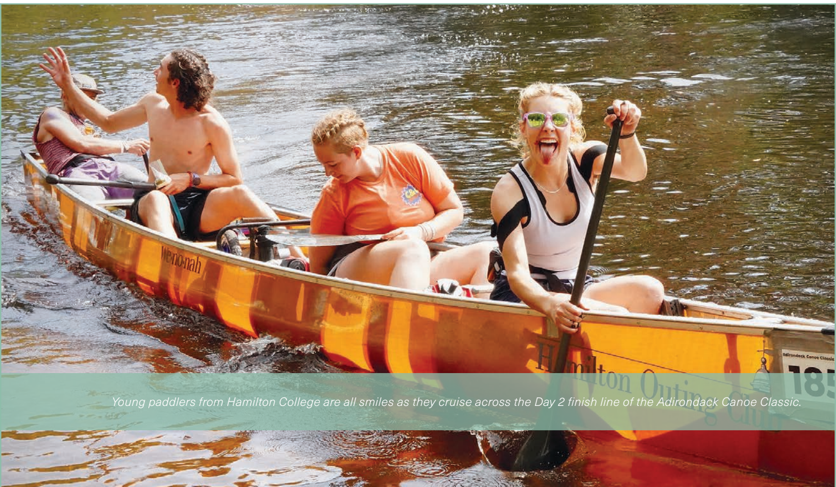
Young paddlers from Hamilton College are all smiles as they cruise across the Day 2 finish line of the Adirondack Canoe Classic.

Change is inevitable and not always easy — it's not unusual for generational shifts to create friction and strife. The NFCT counts itself as lucky that the transitions along the trail have been as smooth and as welcoming as the pristine waters we paddle every day.