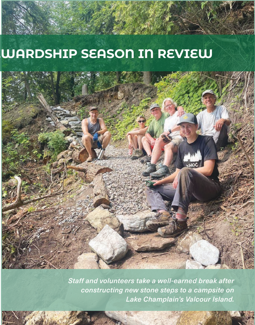
Staff and volunteers take a well-earned break after constructing new stone steps to a campsite on Lake Champlain's Valcour Island.