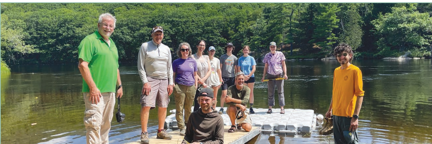
The NFCT's stewardship crew installed a new floating dock at the take-out above the Gorham Dam on the Androscoggin River, part of a larger effort to enhance access to the river for paddlers, anglers, tubers and other users.

Lake Champlain Basin Program • Athletic Brewing • NYSDEC • Neil and Louise Tillotson Fund Great River Hydro • Maine Outdoor Heritage Fund • Quimby Family Foundation Maine Bureau of Public Lands • Maine Recreational Trails Program NH Charitable's Upper Connecticut River Mitigation and Enhancement Fund UMATR • Town of Gorham • Vermont River Conservancy • The Davis Conservation Foundation Rangeley Lakes Heritage Trust • Northern Waters Outfitters • Huber Resources Maine Appalachian Mountain Club