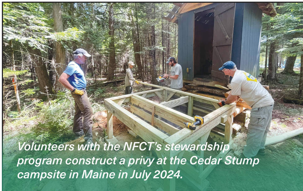
Volunteers with the NFCT's stewardship program construct a privy at the Cedar Stump campsite in Maine in July 2024.

July 25-27, Haley Pond/South Branch Dead Carries, Rangeley, ME